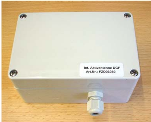
Plastic housing IP65 with MBF12 cable screwing